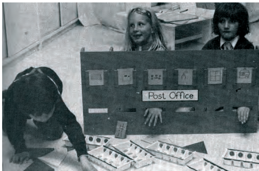
Teaching Practice with ‘less able’ children

Students who “lived in” will no doubt be interested that 32 double beds were converted to single, 100 mattresses were bought for £2 each (“they served for a long time” I hear the cry). When new beds were purchased for Rockwood students were not allowed to sit on them! A contract for catching cockroaches, rats and mice was placed. Provision of adequate fire escapes was a concern but who was to use them and to go in which direction was not made clear. Drain pipes also served. A signing out and in book, together with male visitors being restricted to the lower lounge in Rockside, no doubt influenced the use of the fire escapes.