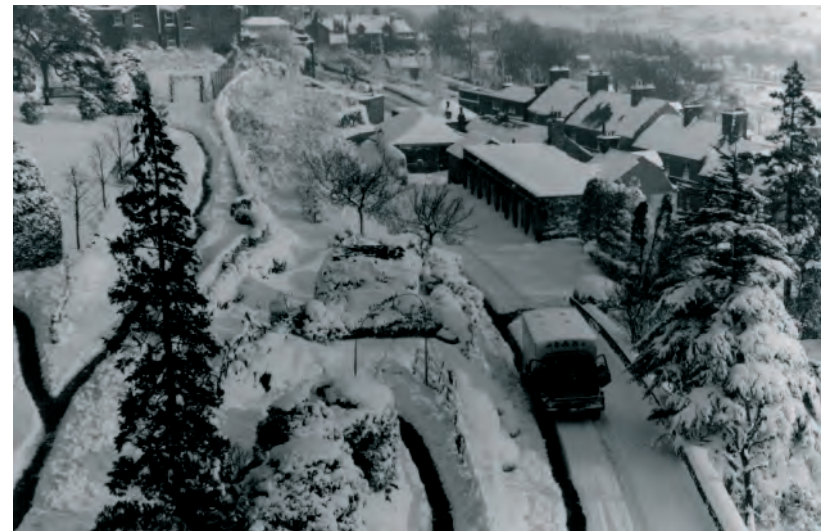
Snow from Rockside