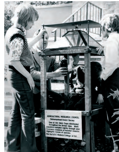
Junior Field Club at College

From 1967 the college was formally associated with the London Urban Studies Centre in East London which served as a residential and study centre for teaching practice in London. Eventually in 1972 a four year B.Ed. degree which included teacher qualification was offered, being validated by Nottingham University (alongside the certificate). It had the possibility of an honours award and the certificate was eventually dropped. The students’ studies involved a Main Course, The Theory of Education and Curriculum studies which are about the process of teaching related to the age range it is proposed to teach. The students had twelve weeks of "School Practice".