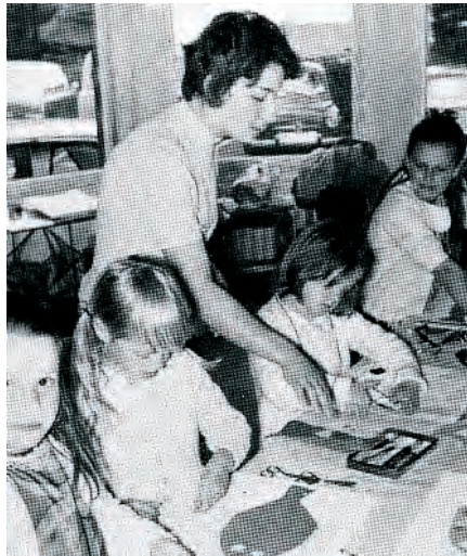
Art on Teaching Practice