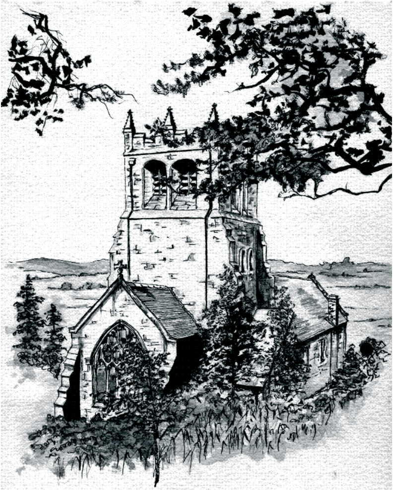
Christ Church, Lea and Holloway