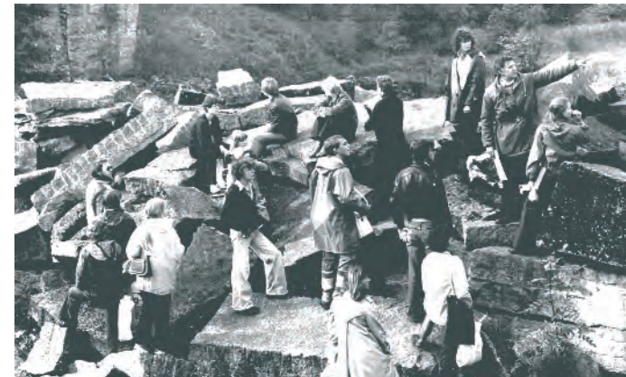
Field work in a quarry

"The first students were a hardy lot because the early part of 1947 was remarkable for the heaviest snowfall within memory. For weeks on end we looked out on deep snow which completely covered hedges and stone walls and signposts, and came half way up telegraph posts. Indeed, there were drifts round college over twenty feet deep. It was almost miraculous that food (still rationed) and fuel reached us. Sledges were much in evidence and a few skiers found conditions much to their liking. Students who ventured out on foot had their adventures though no limbs were broken. We had to wait until 1958 when men joined the college and played soccer and rugby for the cases of fractured arms and legs.