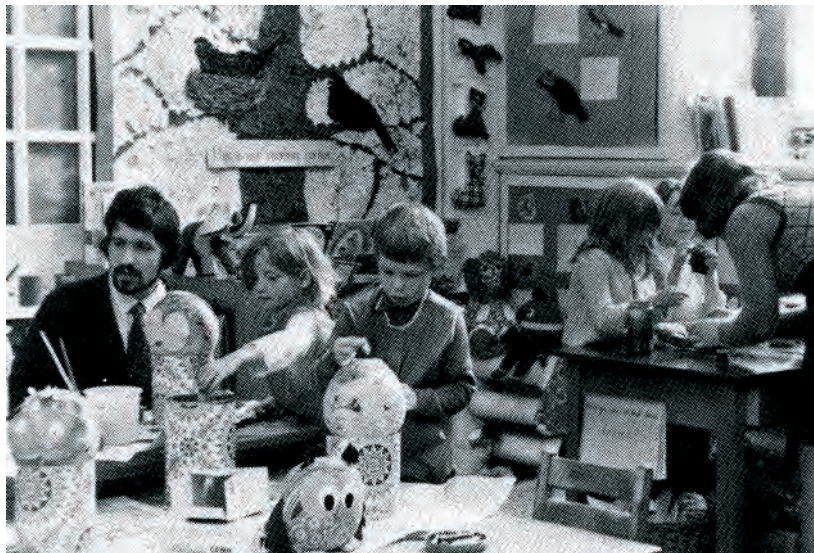
Art in school

Main courses were often a continuation of the student’s sixth form studies. If they were to teach the secondary aged pupils there was obviously value in them having a fund of accurate facts and concepts to illuminate their own lessons. In Junior schools, and even Infant ones, subject matter was being enlarged and given a clearer subject identity, so even there a person with a specialist slant in addition to their general abilities was of value.