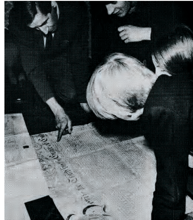
Study of contemporary documents

“All students on entering Teacher Training had to study Education as a subject in addition to their choice of a Main Course. The students were randomly allocated an Education Tutor who would be "theirs" for the whole three years. In many cases this led to the growth of a worthwhile feeling of belonging to that group and engendered to a larger or lesser extent an appreciation of all those with very different experiences and knowledge through their Main Courses.