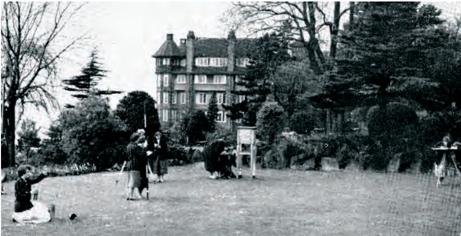
Learning to survey on Rockside lawn