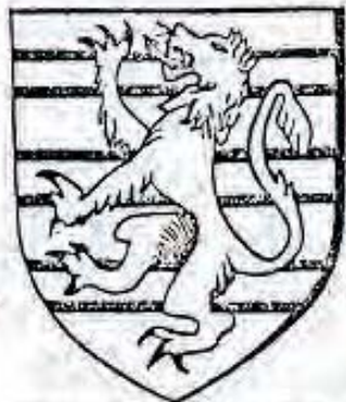
ARMS—Arg. a lion rampant, gules over all three bars, gemels, sable.