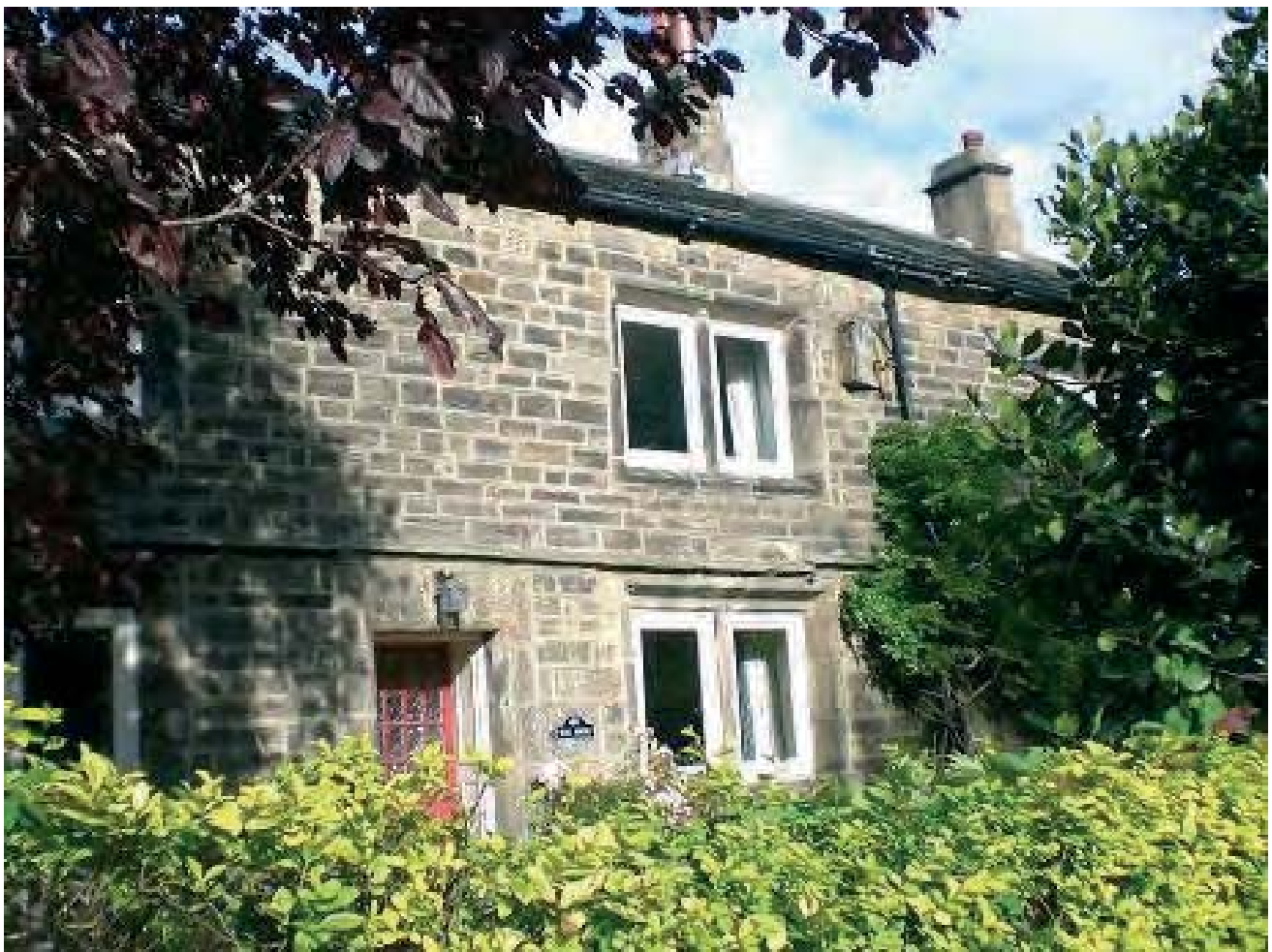
The Dial House, Burley-in-Wharfedale