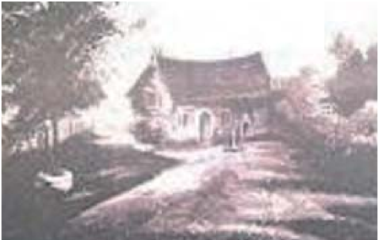
The Old Chapel, ca 1640, Burley-in-Wharfedale